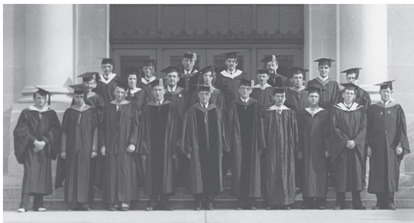
The College's faculty in 1936 at Union's first Commencement Ceremony.

In January 2020, renovations on the Health Science Building on the Plainfield Campus were completed, adding state-of-the-art facilities and labs for the paramedic