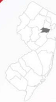
Union County, NJ