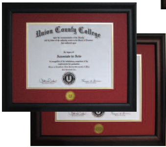
#3 "Briarwood" Wood Frame Contemporary Briarwood diploma frame in Black or Mahogany with a double mat in red and gold, embossed with the UCC seal in gold foil. $91.95