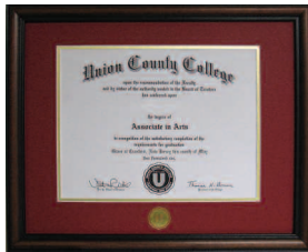
#2 Walnut Wood Frame A traditional walnut colored wood diploma frame with a double mat in red and gold, embossed with the UCC seal in gold foil. $63.95