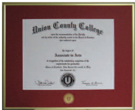
#1 Polished Gold Frame An attractive polished gold frame with a single mat in red with the UCC seal in gold foil embossed on the matting. $44.95