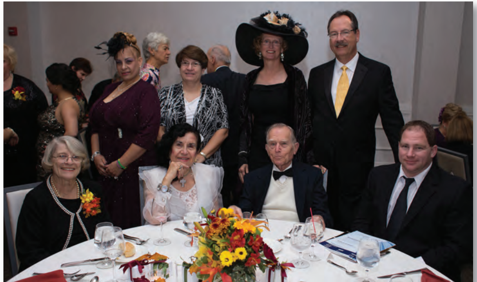
As attendees and donors of the table favors, the Alumni Association helped make the Nov. 7 Scholarship Gala the College's most successful fundraiser in Union's 82-year history.

One of the ways the Association tries to boost membership is by hosting special events like the recent Jazz concert and