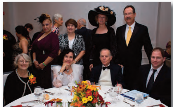
Alumni attending the 2014 Gala will be coming out again en masse on Oct. 2.

Thank you for being Union County College Alumni.