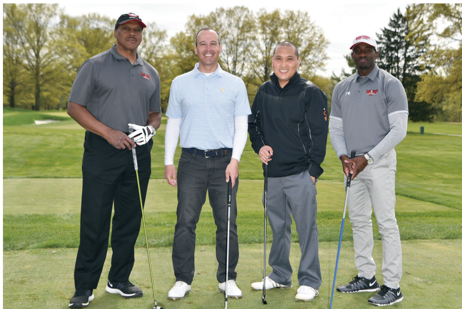
Members of Union County College staff play 18 with our friends from CLA