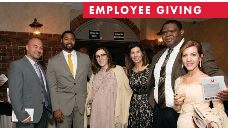
Faculty and staff enjoying a night out at the Gala in October