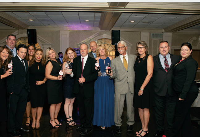
Liberty Coca-Cola Beverages celebrating their night as the 2018 Corporation of the Year