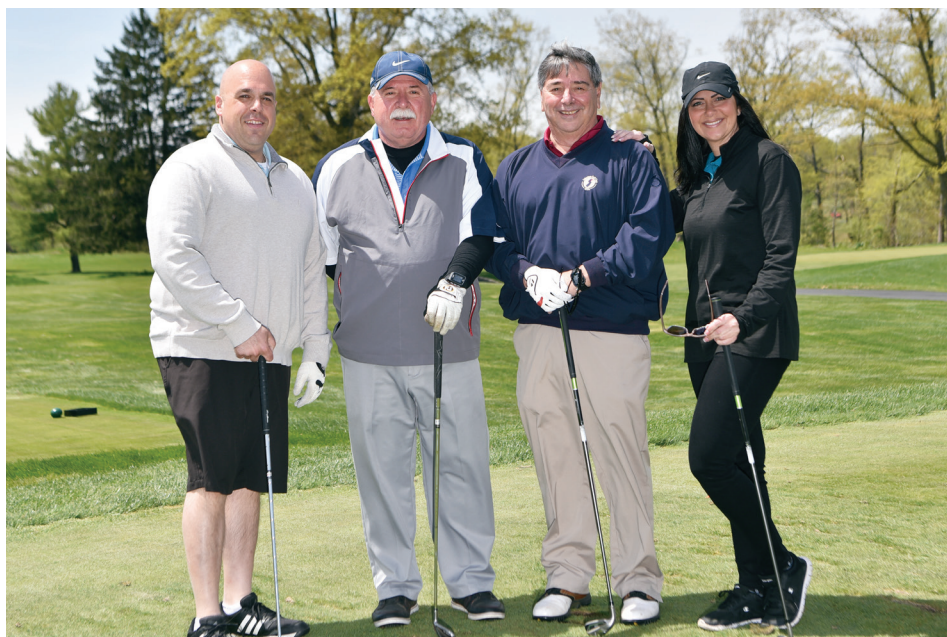
Cocktail sponsor, BCB, enjoys a day on the links