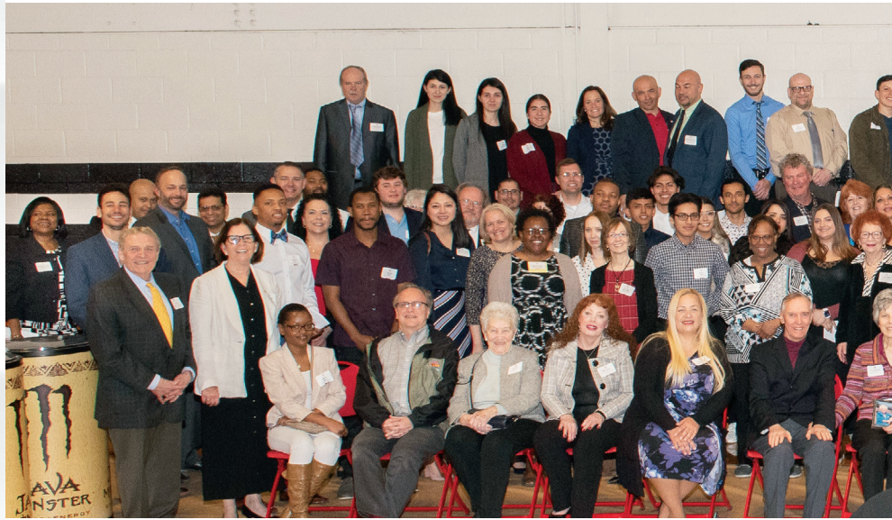
In April over 225 donors and students came together for the Foundation's annual Scholarship Reception. This year the Foundation implemented a new format that allowed our donors and their scholarship students to spend more time getting to know each other.