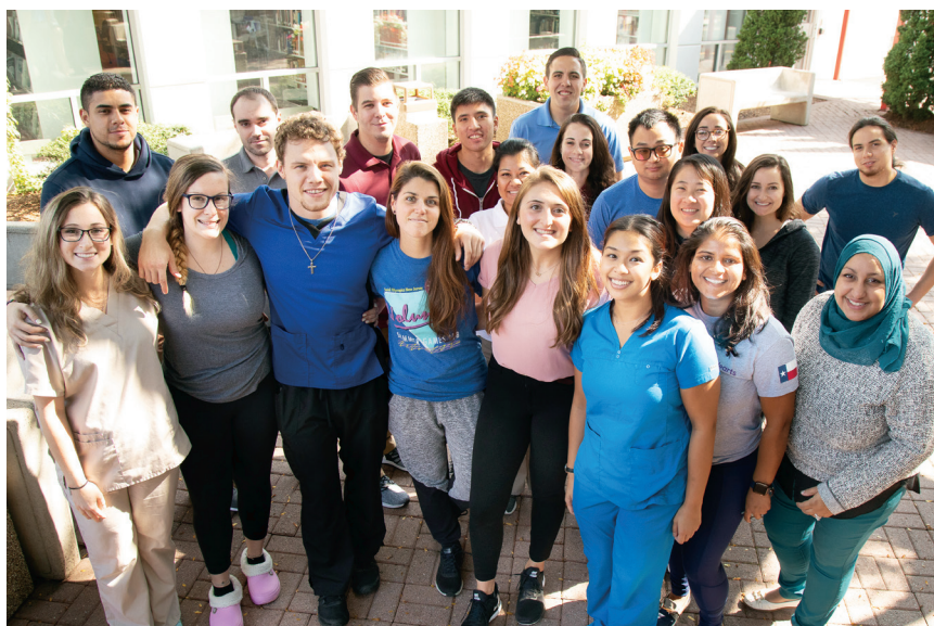
The future looks bright for our students thanks to all of our donors

Lives have been turned around because of the generosity of our donors. The Foundation and Union students greatly appreciate the support and assistance. Thank you!