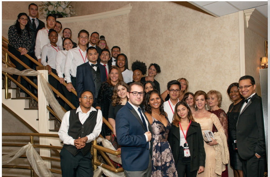
Student volunteers and guests with members of the faculty and staff enjoying a night at the Gala

In Celebration of Union County College The following academic disciplines and administrative departments donated items featured in the Gala auction. We greatly appreciate the generous spirit and assistance of our faculty and staff. With their support, we are able to raise money in support of scholarships which has a positive impact on our students.