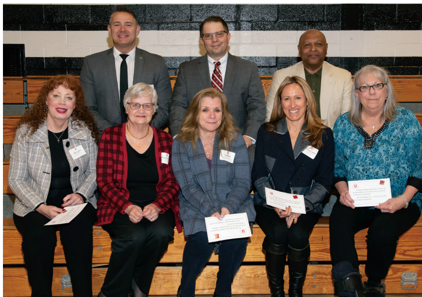
Some of the new scholarship donors at the Scholarship Reception on April 9, 2019

The Foundation supports a robust scholarship program, and continues to seek new sources. For more information on establishing a scholarship, please contact the Foundation Office at (908) 709-7505.