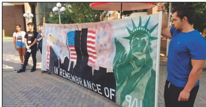
Members of the College community held the banner created by Union students.

At 9 a.m. on Sept. 11, members of the Union community gathered near the flag pole in the Plaza on the Cranford campus to commemorate those lost 18 years ago during the 9/11 attack. The Student Government Association (SGA) helped coordinate the event. In addition to the American flag being flown at half staff, smaller flags were placed throughout the Plaza as a remembrance of those who perished.