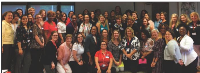
The women of Union County College who are interested in participating in the AAWCC chapter.